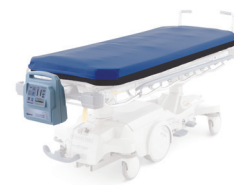
Dolphin™ Stretcher Pad

Automate how your staff prevents and treats wounds.