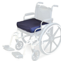
Dolphin™ Wheelchair Cushion